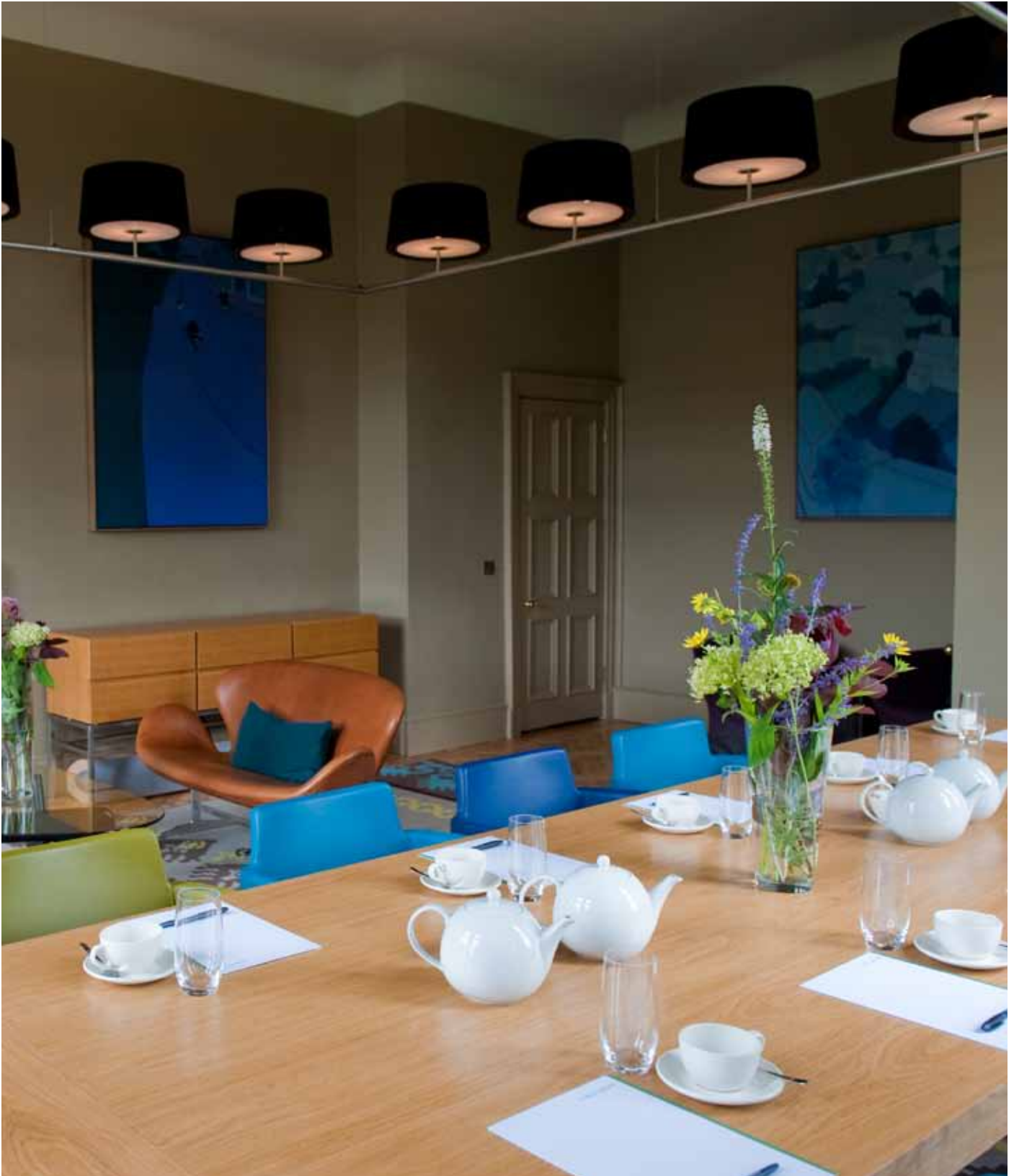
An Away Day