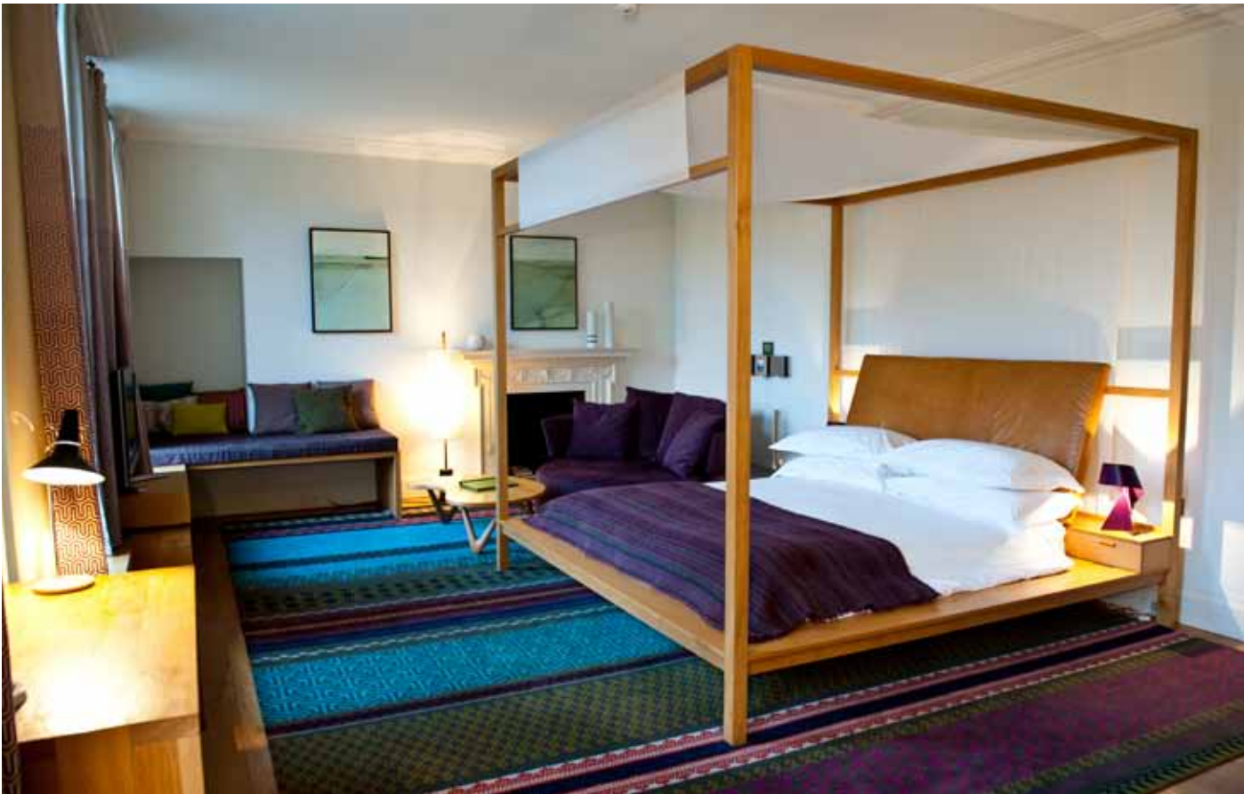
Best Room in the house

Our rooms are divided into Good, Better, Great, Exceptional and Best.