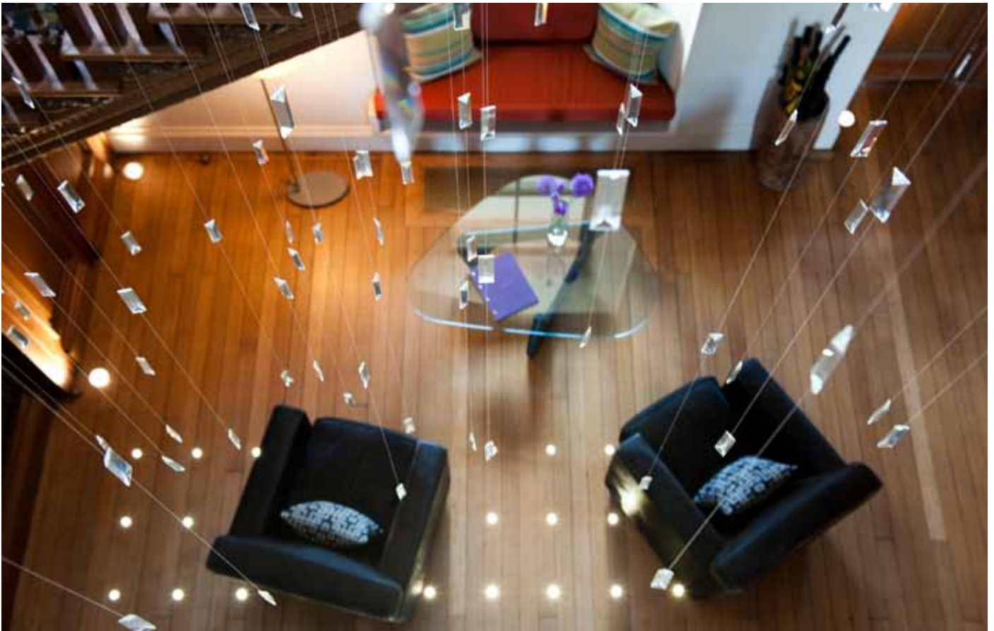
Reception as seen from the main staircase

*Please be aware that Day Spa members and their guests may use the spa facilities during exclusive use. Minimum spends noted are from September to March.