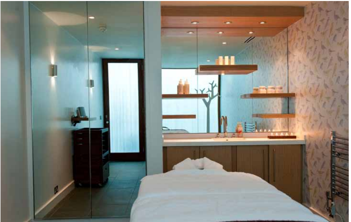
A treatment room at C.Side

An ideal spot for members in your party to pamper themselves with 20% off treatments with an exclusive use.