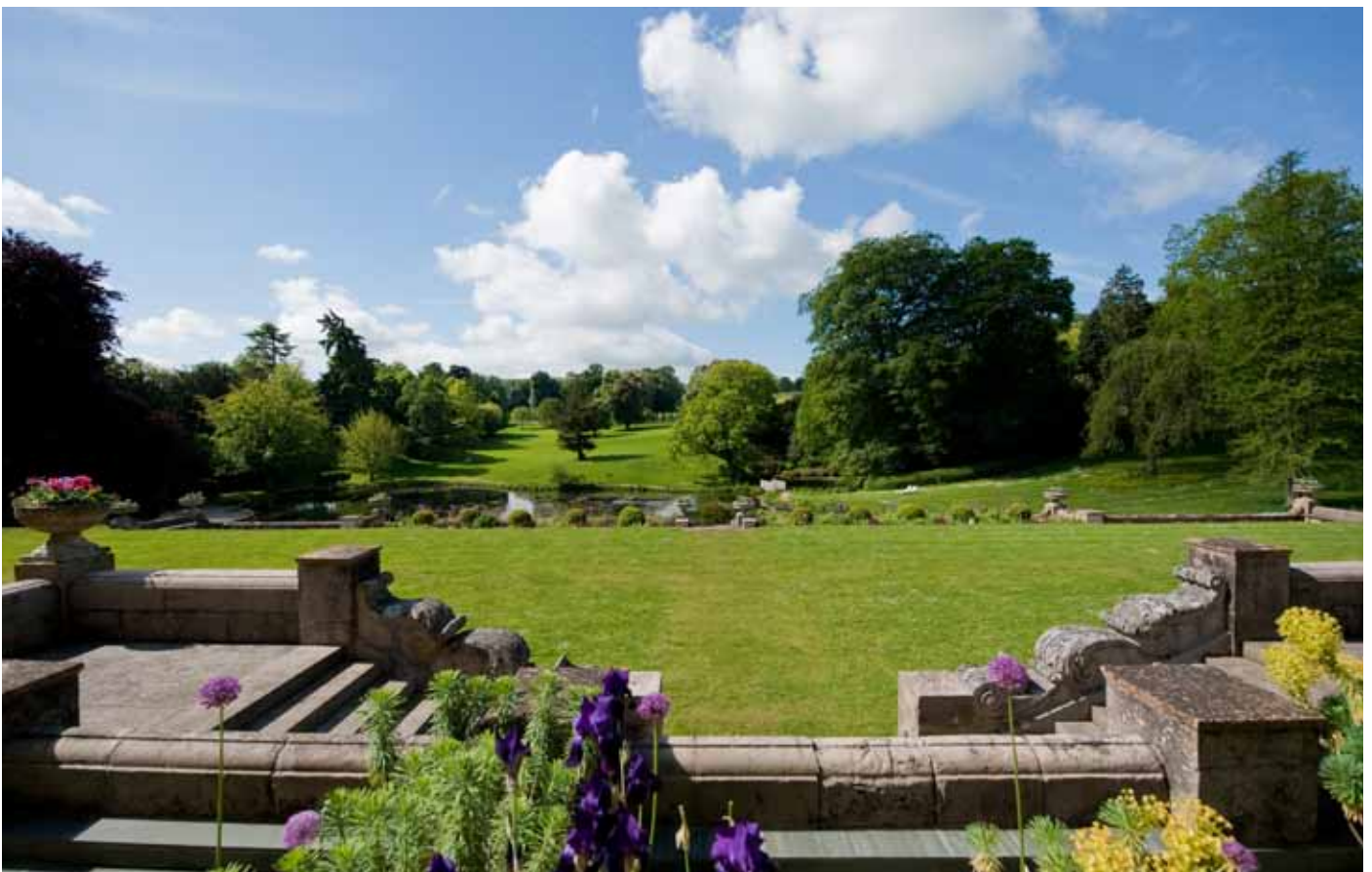
The gardens at Cowley Manor

Tel: +44 (0) 1242 870 900 Fax: +44 (0) 1242 870 901 Email: events@cowleymanor.com