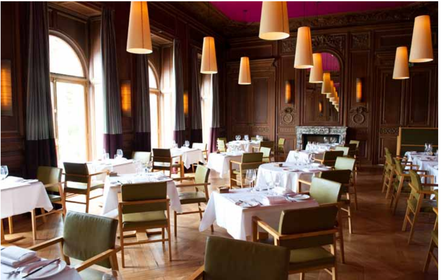
The Restaurant at Cowley Manor