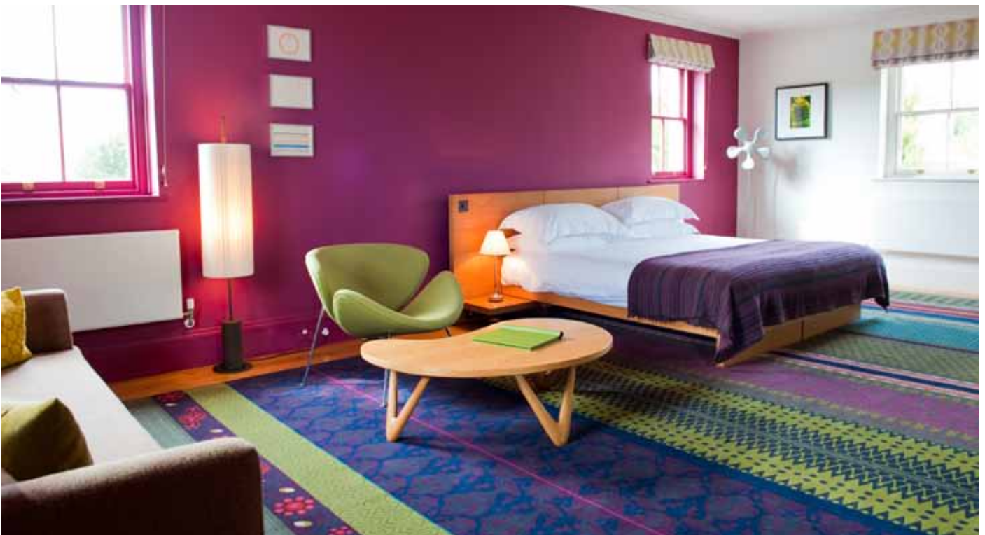
A Great Room in the Main House