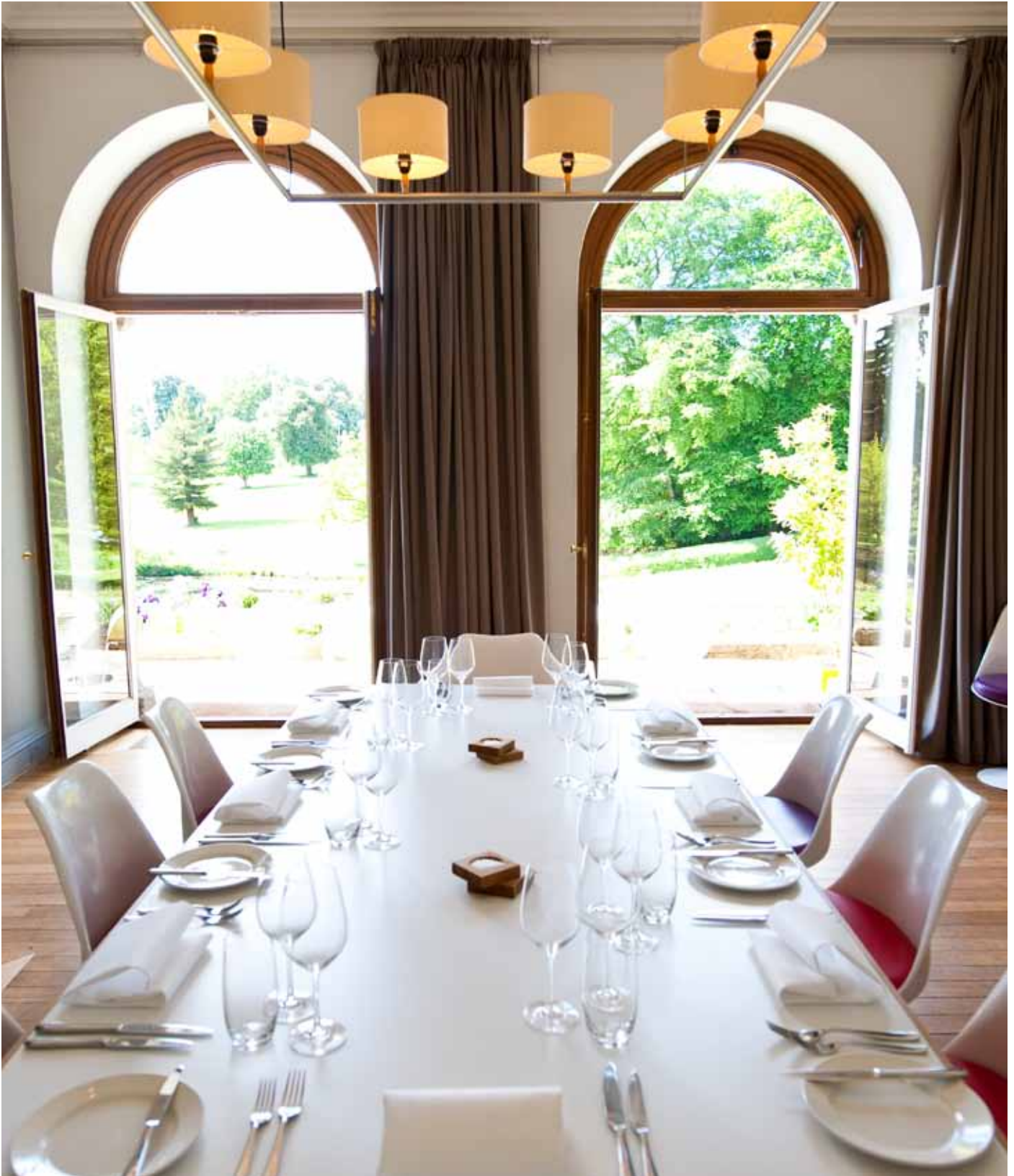
Private dining with a difference