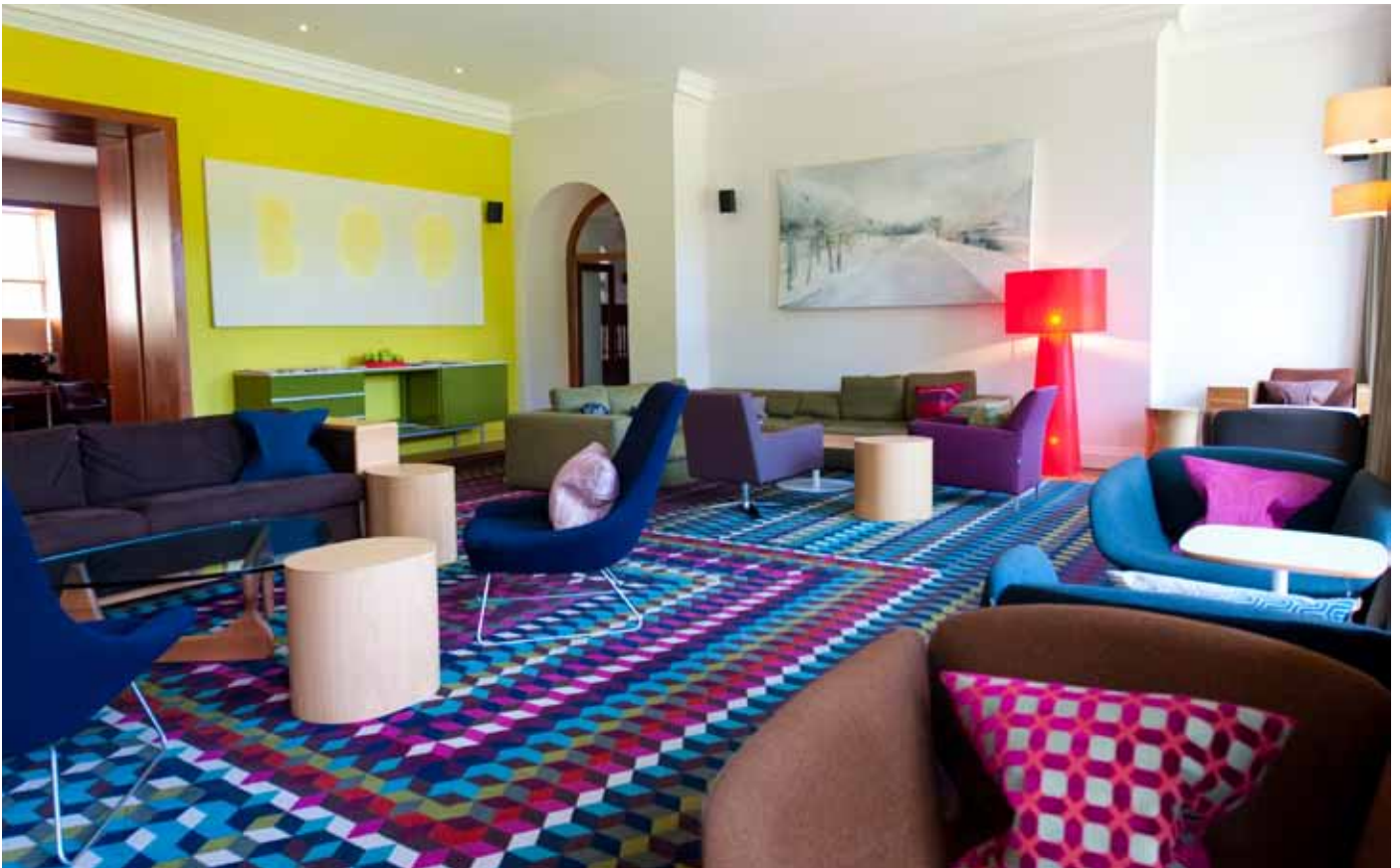
The Sitting Room