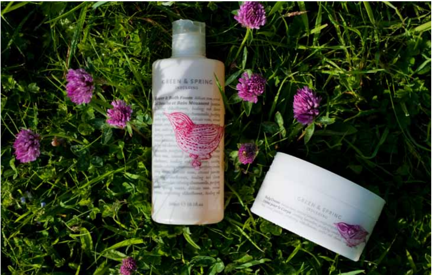
Green & Spring products, inspired by the grounds at Cowley Manor

Found in the Village Shop, at C.Side and in the bathrooms at Cowley Manor, we can arrange goodie bags for your guests to take away and continue the retreat at home.