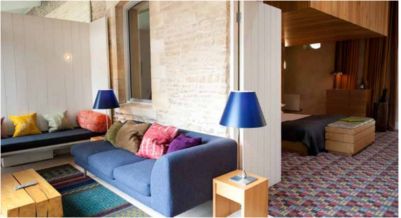
The private sun room of an Exceptional Room in the Stable Block